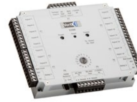
◀ VertX V200 Input Module

Choose the Synergis IP access control solution to protect your people and assets with your choice of widely-deployed, non-proprietary, and secure access control hardware.